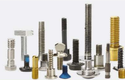
Special and Standard fasteners